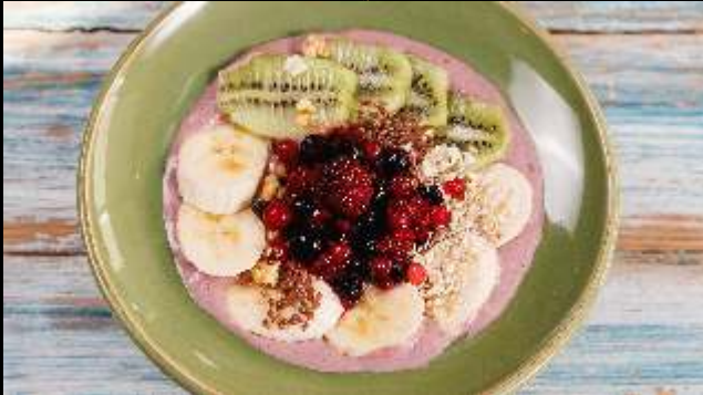
Açaí Yogurt Bowl