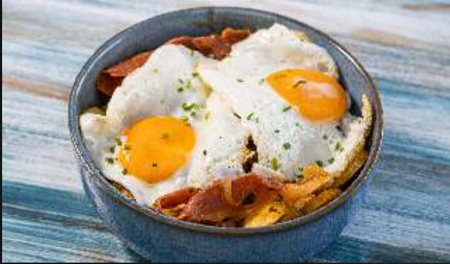
Ovos Rotos à Gato