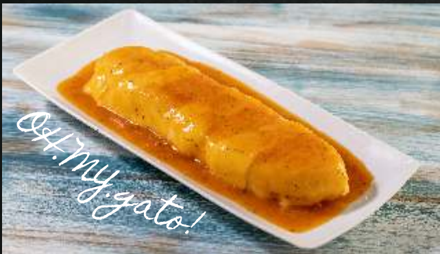
Special Hot Dog "O Gato"