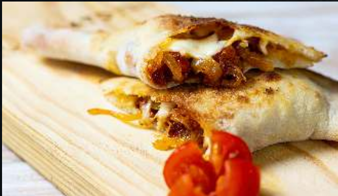
Chorizo and Bacon