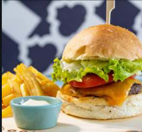
Vintage 24 Burger