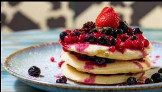
Red Fruits Pancake