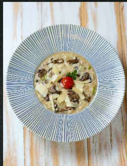
Risotto Dos Marquesados ✓