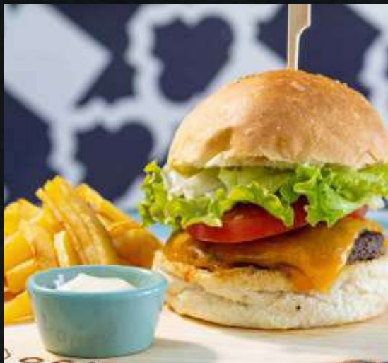
Vintage 24 Burger