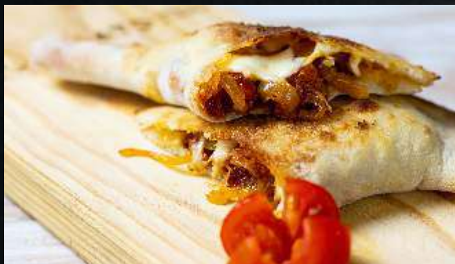
Chorizo and Bacon