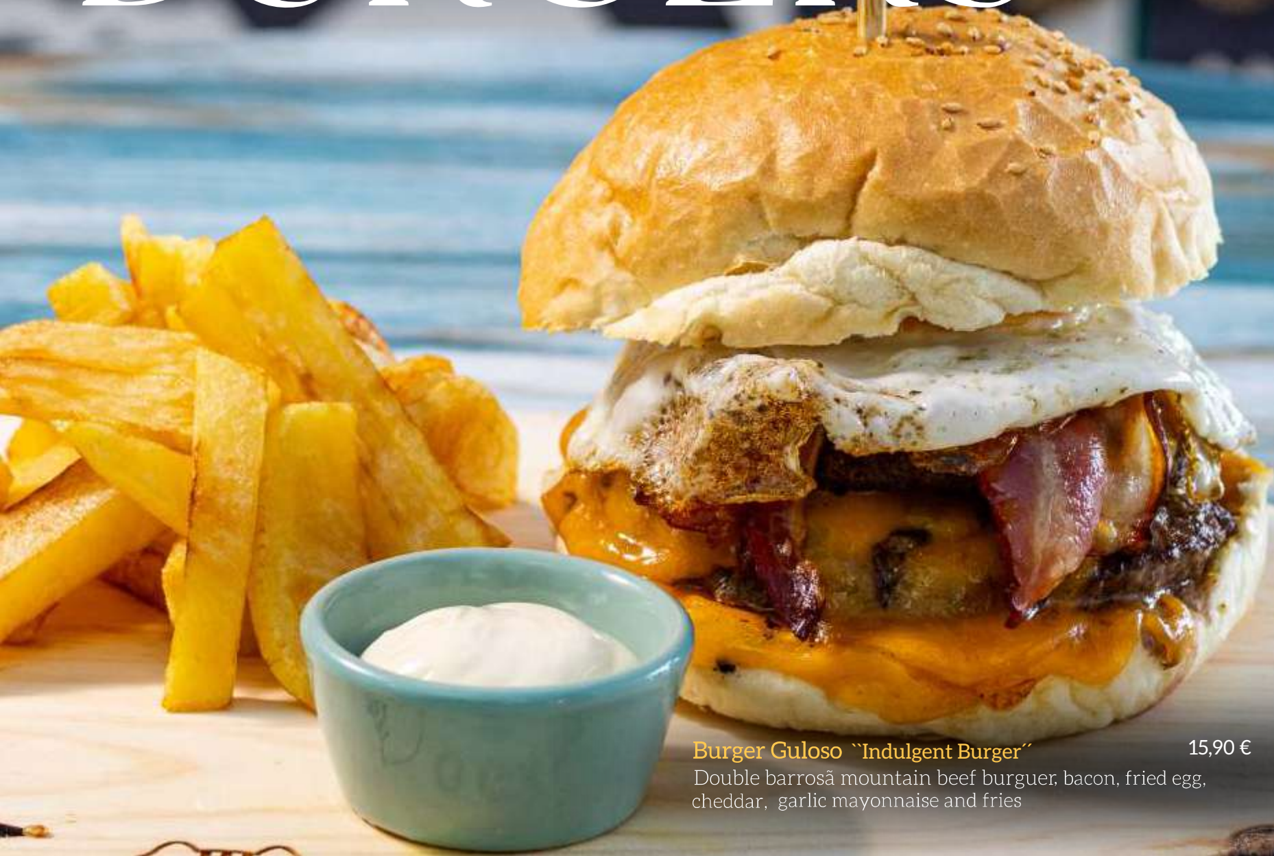
Burger Guloso "Indulgent Burger"