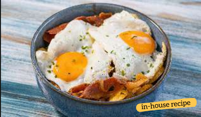
Ovos Rotos à Gato