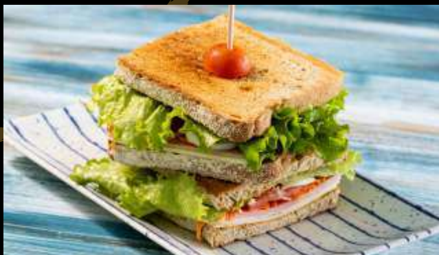
American Rustic Toast