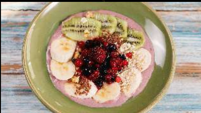
Açaí Yogurt Bowl