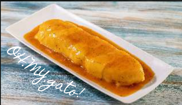
Special Hot Dog "O Gato"