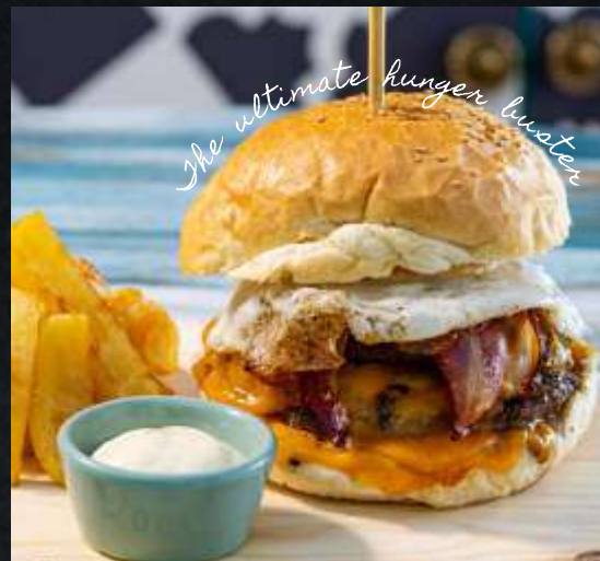
Burger Guloso "Indulgent Burger"